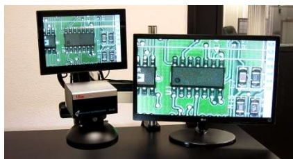
Dual screen output with an video splitter (not included)

The use of a digital microscope is becoming essential as the components gets smaller to accommodate more parts on a PCB surface. The new digital microscope enables users to improve quality and increase output efficiency while being ergonomic. The DM-S7 is ideal for first article inspections, all electronic printed circuit board inspections, CNC industrial applications, medical, and aerospace applications. Every aspect of use has been taken into account during the design process, providing an effortless user experience across all industries and increased user comfort. The DM-S7 includes the 10.1 Capacitive Touch Screen high resolution display, sturdy articulating arm, diffused dome light, and 8GB USB thumb drive.